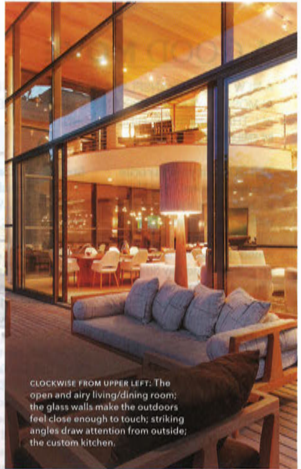
CLOCKWISE FROM UPPER LEFT: The open and airy living/dining room; the glass walls make the outdoors feel close enough to touch; striking angles draw attention from outside; the custom kitchen.